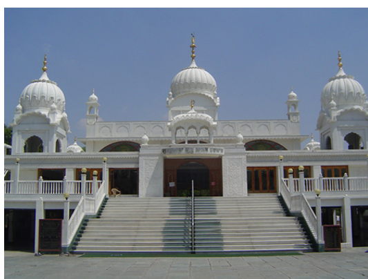
The Guru Nanak Darbar (a Sikh palace in Pune)

Each NAN will be contacted directly with a request to send two delegates, the coordinator or another NAN representative and a patient representative to the meeting in India. All delegates of the Patient Advocacy Meeting will be automatically registered for the Network Conference as well. The official invitation and necessary registration information will be sent in May, so please keep the dates and watch for further announcements on www.bjdonline.org