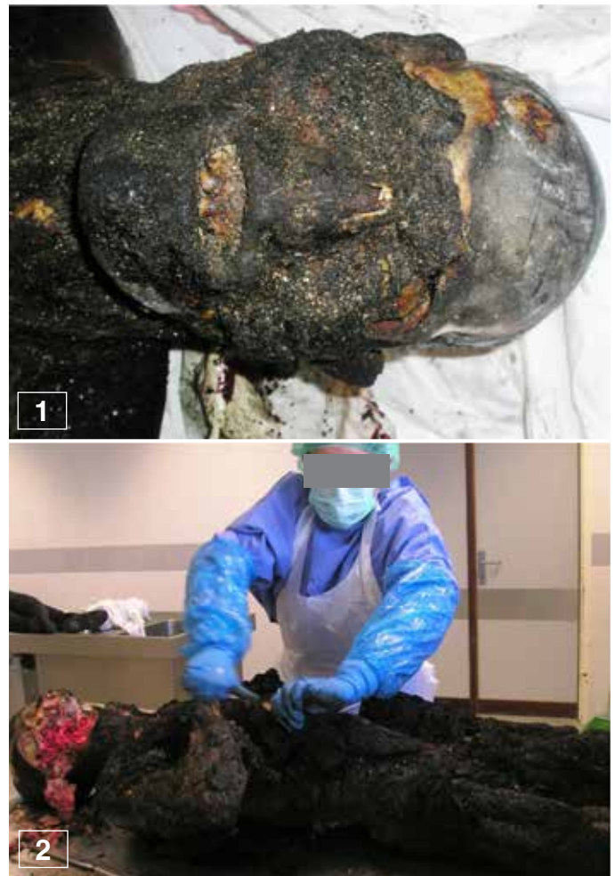
Figures 1 and 2 – Necropsic characteristics of a carbonized body. Note the hardening of the tissues and the loss of the extremities through calcination, thus making the usual identification methods difficult.

Human identification is possible if the identity of