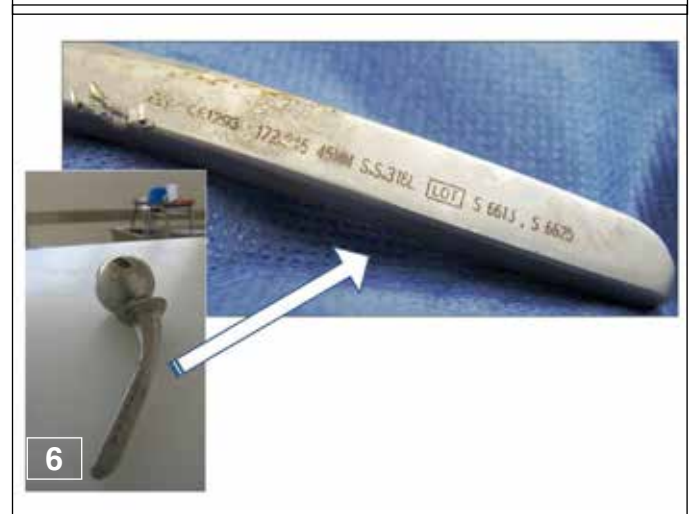
Figures 5 and 6 – Like pacemakers, orthopedic prostheses have serial numbers associated with barcoded labels that should appear in medical files, thereby enabling rapid identification of the implant and patient.