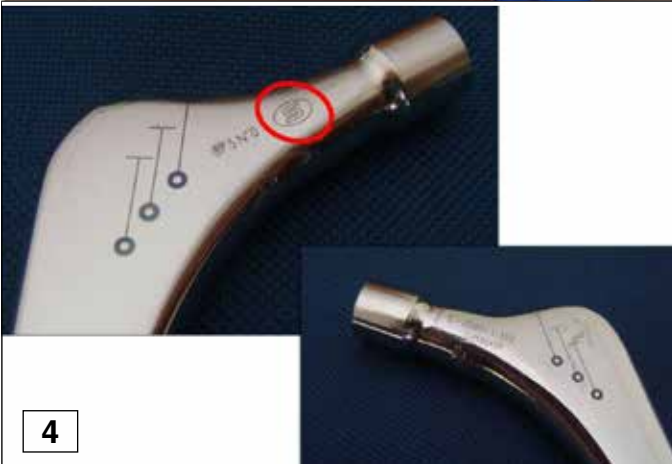
Figures 3 and 4 – Orthopedic prostheses resist violent trauma, thus allowing identification of the manufacturer and making it possible to trace the prosthesis.

with growing life expectancy and the demands for quality within this life, have made arthroplasty extremely popular (12) .